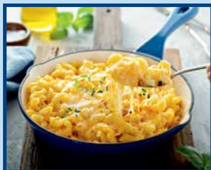
So You Think You Can't Cook?