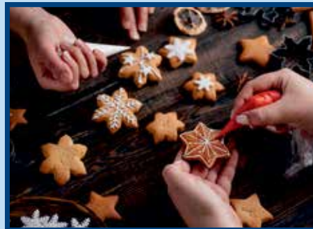
Holiday Cookies: Introduction to Flood Frosted Cookies