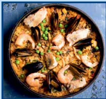
Not-so-scary Main Courses