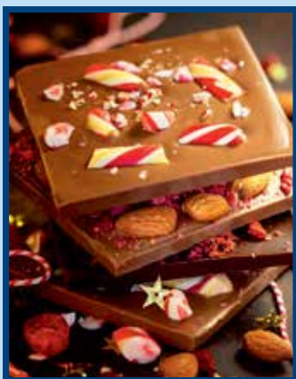
Sweet and Savory Gifts from the Kitchen

For these classes, we recommend parking on the east side of the building (across from Loring Arena). The kitchen is very close to that entrance.