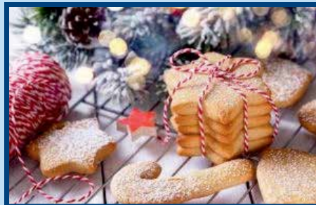
Holiday Cookie Swap