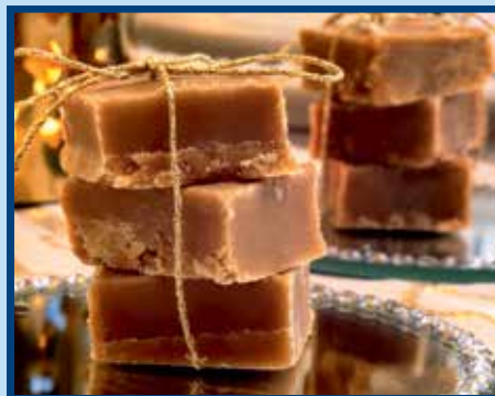
Peeps, Fudge & Truffles, Oh My!