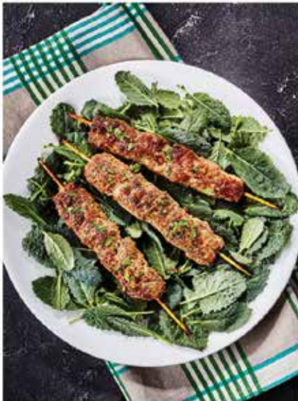
Moroccan Kefta Kebabs