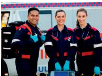
EMERGENCY MEDICAL TECHNICIAN, EMT CERTIFICATION TRAINING