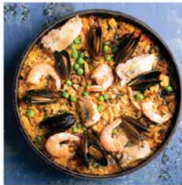
Spanish/Mediterranean Seafood Paella