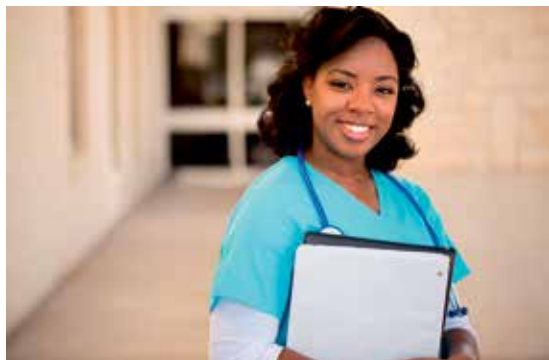
CLINICAL MEDICAL ASSISTANT CERTIFICATION TRAINING