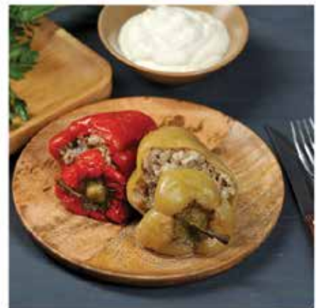
Croatian Stuffed Peppers

Sign up for individual classes or the entire series.