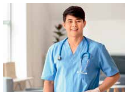
CERTIFIED NURSE ASSISTANT TRAINING