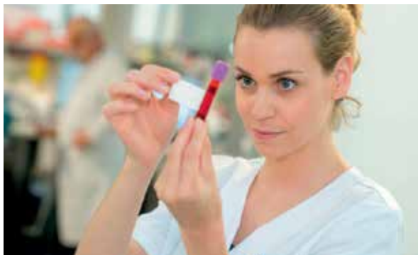
PHLEBOTOMY TECHNICIAN CERTIFICATION TRAINING