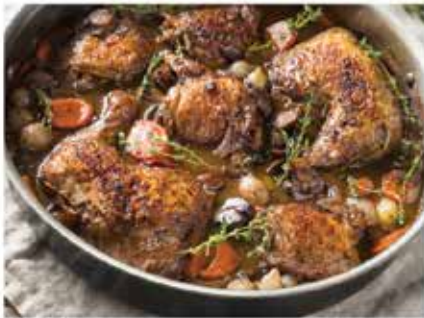
Poulet à La Provençal

Learn to cook 6 Mediterranean dishes. Series Starts on March 16, 2023