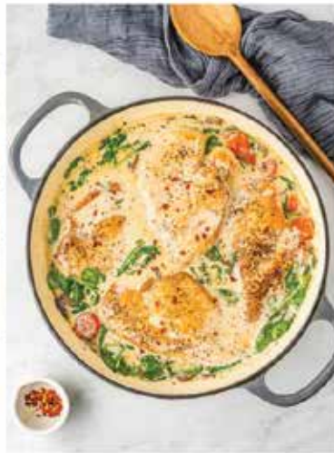
Chicken Florentine Rollatini