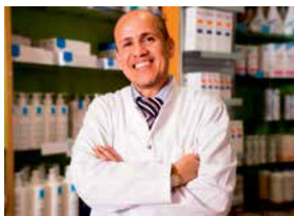
PHARMACY TECHNICIAN TRAINING