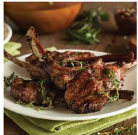
Greek Pan-Seared Lamb Chops